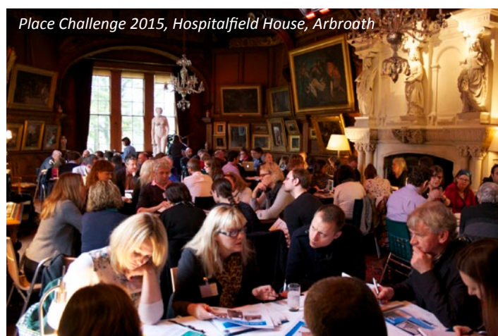
Place Challenge 2015, Hospitalfield House, Arbroath