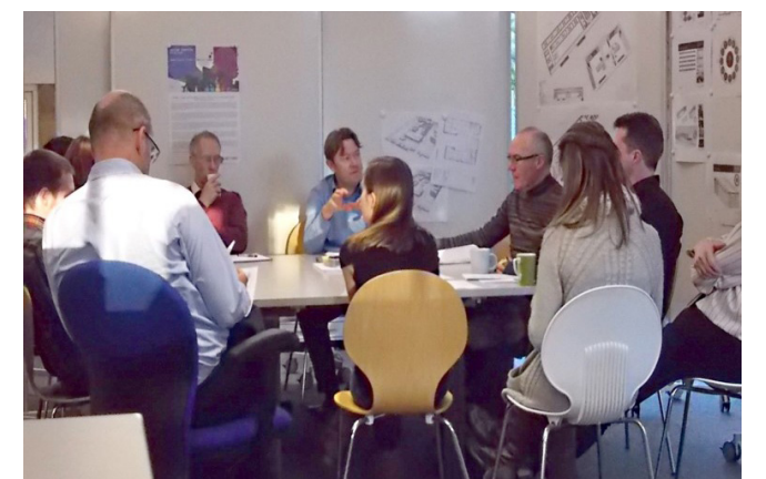
Top to bottom: Woodland View therapeutic garden space | Pre-construction site model | Workshops with key stakeholders.