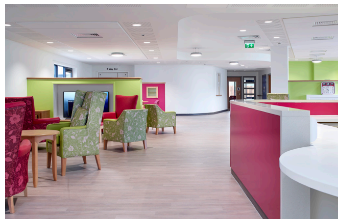
Top to bottom: Woodland View corridors arranged around courtyards | Art strategy integrated into the hospital environment | Woodland View visitor areas.

"Mental health accommodation across the former hospital sites all had serious shortcomings, particularly in their lack of access to safe outdoor spaces. This necessitated staff having to escort patients, often leading to frequent frustration points. The final design was very close to what we described in our design brief, for all single bedroom accommodation on the ground floor."