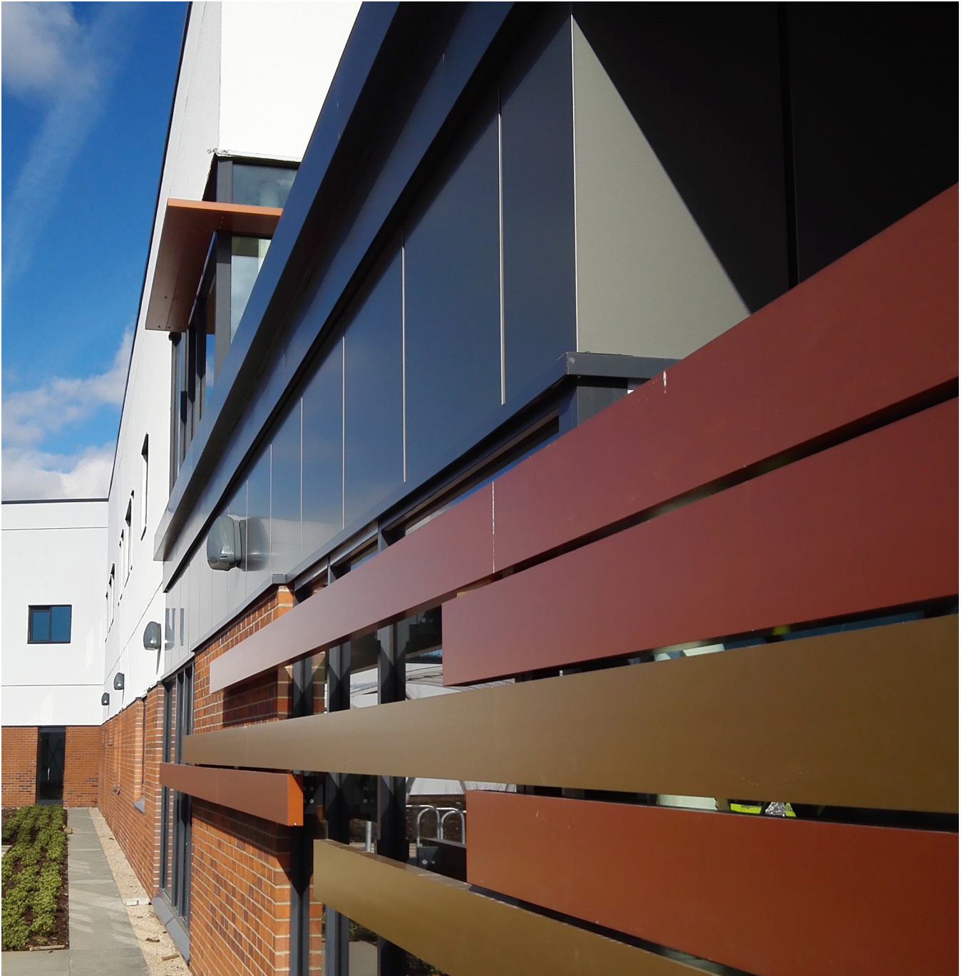
Materials selected were graded in terms of environmental cost and impact on the embodied energy and lifespan of the building.

Certified as a BREEAM Very Good rating, Woodland View was designed to provide a high quality environment for patients and staff whilst minimising utility costs and carbon emissions. High levels of day lighting and natural ventilation help make the space feel light, airy and healthy; with natural daylighting assisting the treatment of patients with dementia through vitamin D absorption. Large areas of glazing are provided to bedrooms, day spaces and many of the corridors, allowing almost all internal spaces to receive controlled direct sunlight. Solar control glass features on facades exposed to direct sun light to reduce undesirable solar gain and minimise solar glare whilst maintaining good daylight levels. The low-rise design makes extensive use of natural ventilation reducing the requirement for supplementary mechanical ventilation where function permits. Ward bedrooms are also naturally ventilated taking advantage of large openable windows whilst remaining safe and secure.