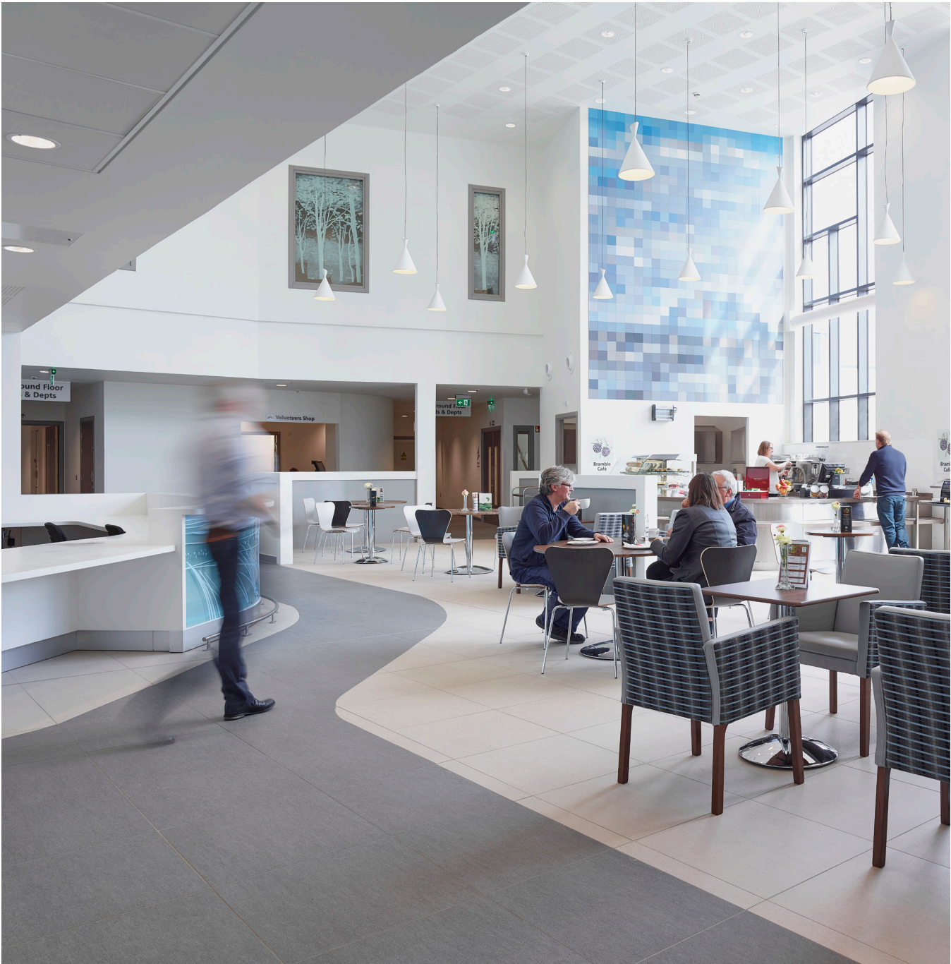
Brambles Café is attracting members of the public as well as patients and visitors, creating a vibrant hub and breaking down the stigma associated with mental health issues.