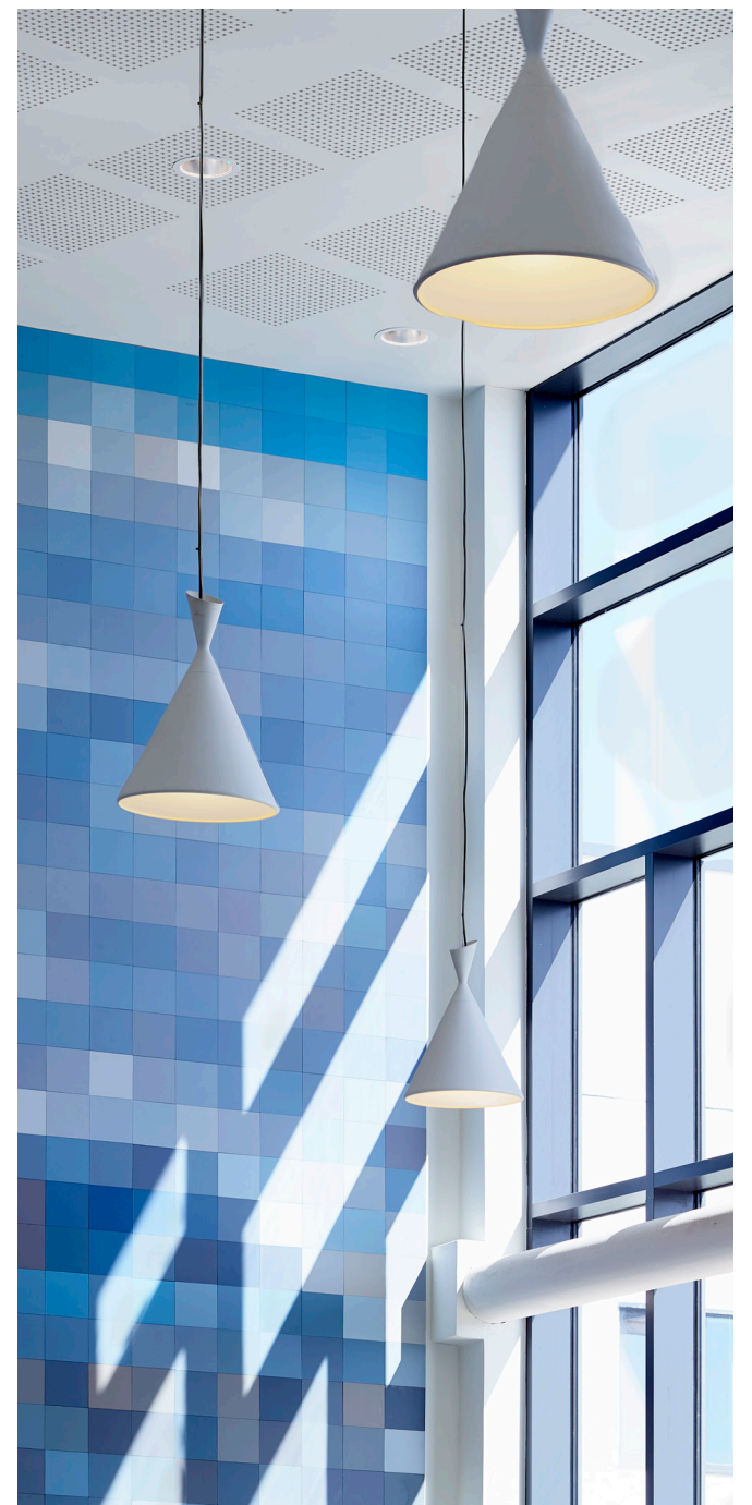
The plaza's height maximises daylight and the lighting of social spaces creates inviting spaces for patients and staff.

Delineated flooring at the entrance to bedrooms for mental health patients helps set boundaries by clearly marking an area within the room that staff will not go beyond, unless in urgent situations. This approach protects the patient's personal space and is used effectively in other countries but not yet widely adopted in the UK.