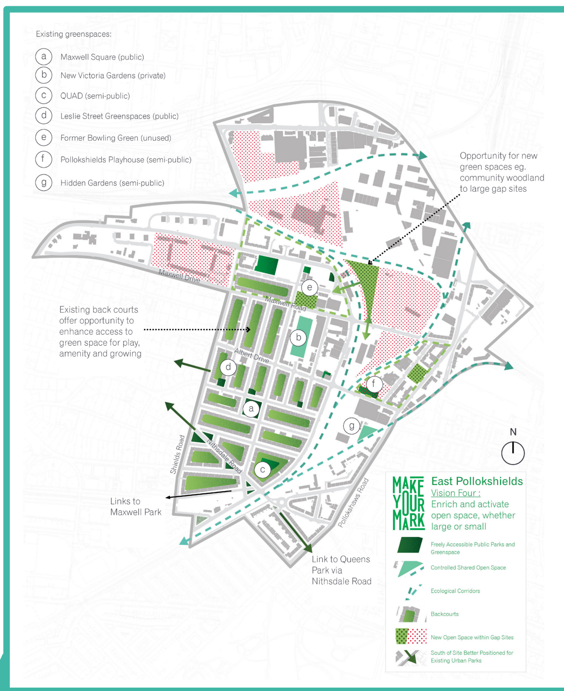
Analysis of green space and links in East Pollokshields

www.dressfortheweather.co.uk/make-your-mark/