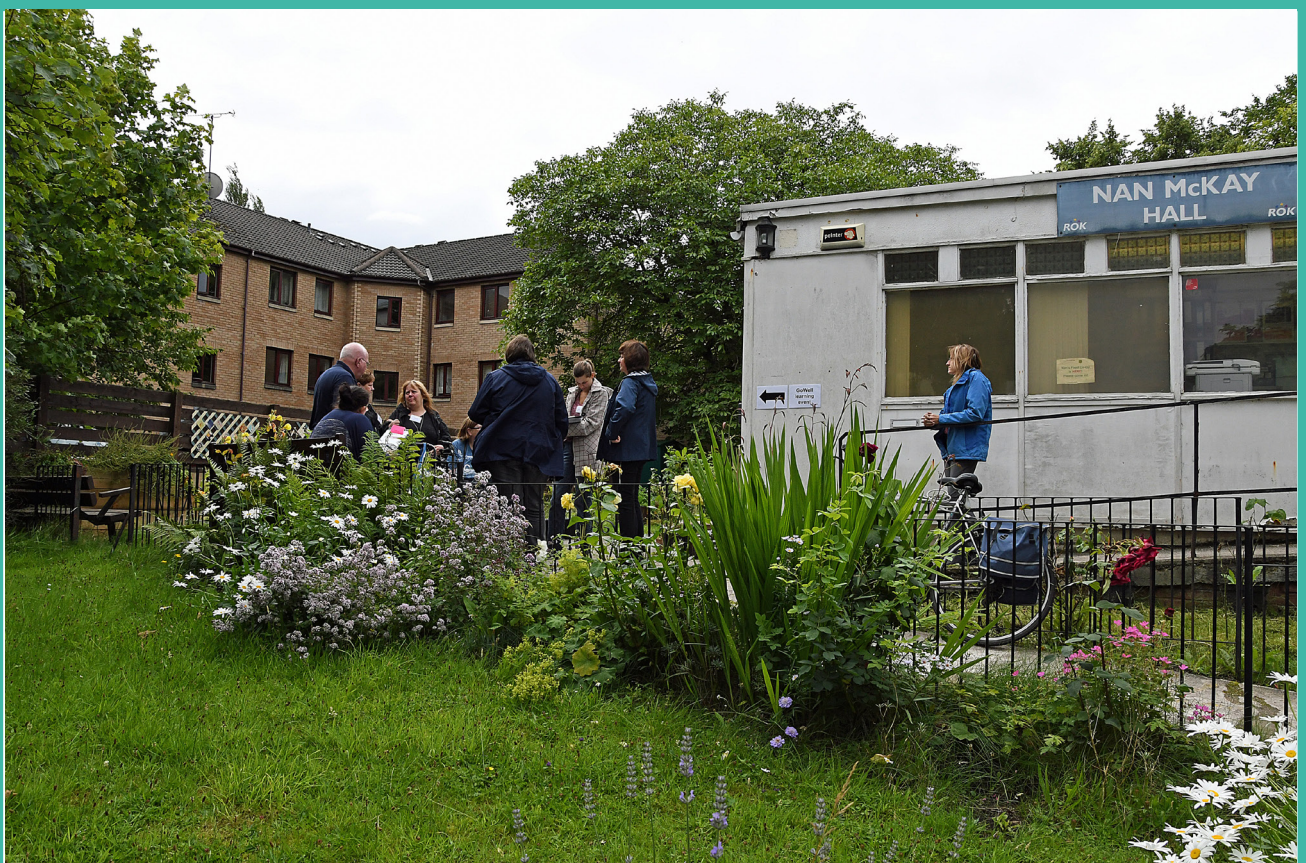
Photo from Place Standard assesment walking tour

www.gowellonline.com/about/components/community_engagement