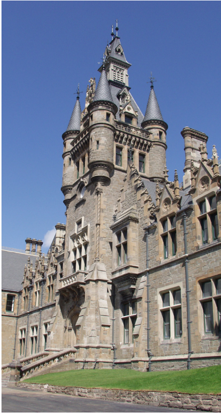
^ Morgan Academy tower

‘practises what it preaches’. But how best to convey such a forward-thinking initiative to the school community and the wider population alike is still a challenge.