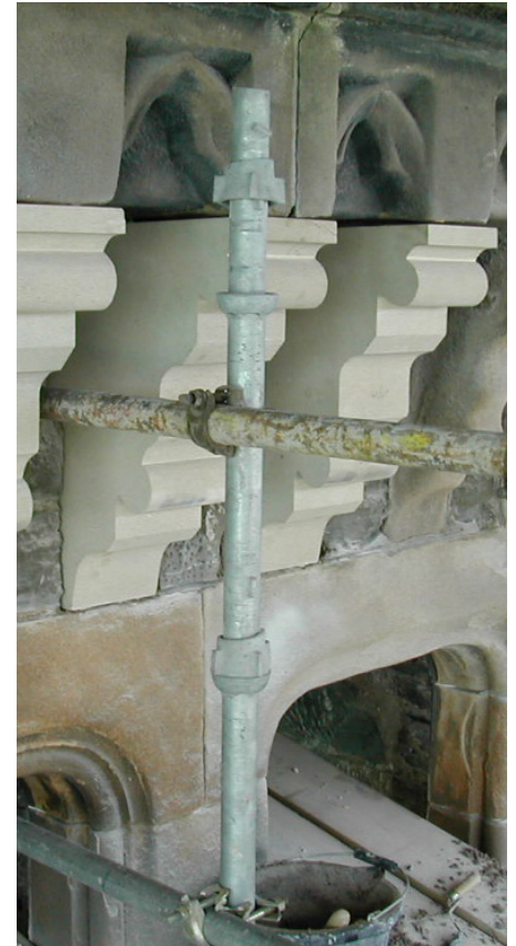
Conservation work of original building

Promoting sustainable development was a major aim under the 'Dundee Sun City' initiative, and the restoration of Morgan Academy was intended to serve as a benchmark for the future – an educational institution that