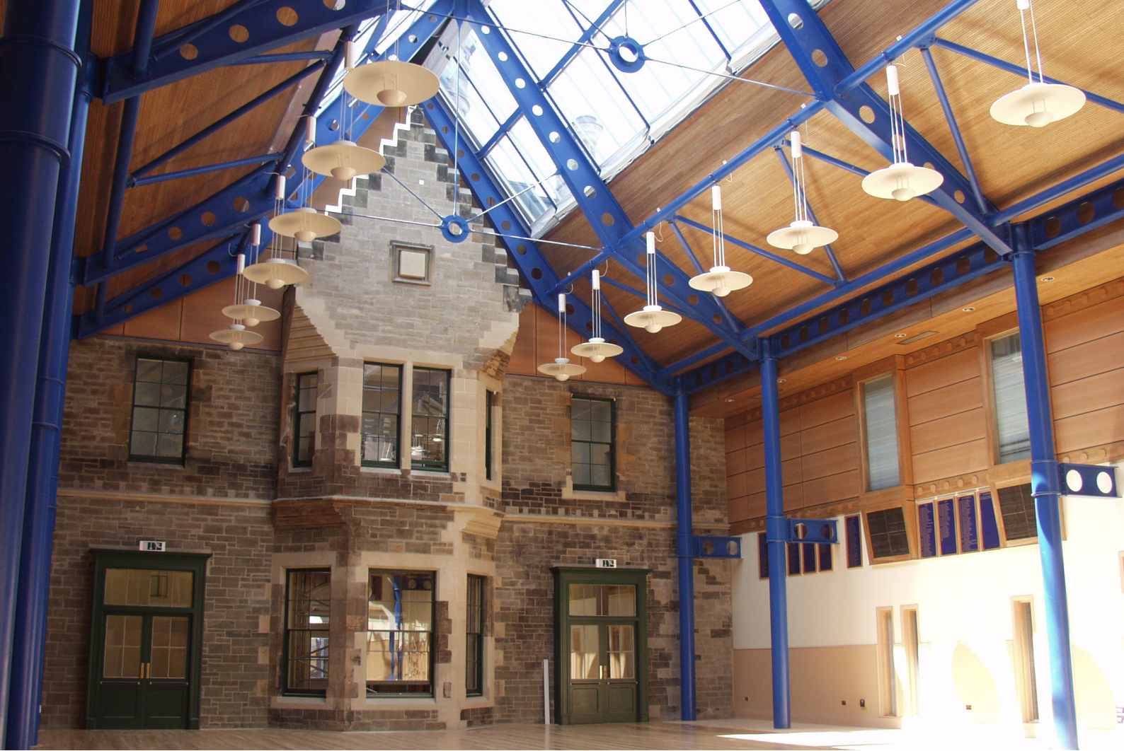
New courtyard assembly hall