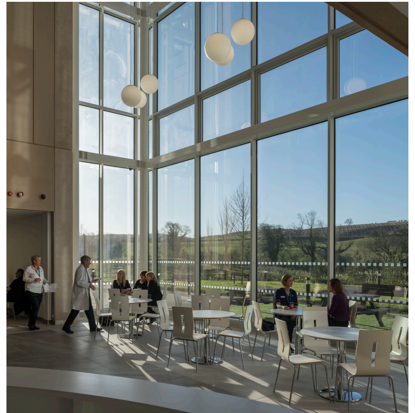
The calm and light-filled therapeutic environment as exemplified in the new Garden Hospital has set a benchmark for future healthcare developments.