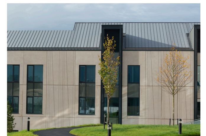
3 Extensive landscaping measures were carried out to ensure that the natural environment was adequately protected.

This was structured around weeklong workshops at monthly intervals with the design team. Through this process, the internal layouts were thoroughly tested” Ian Crow, Ryder Architecture