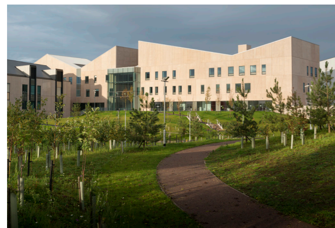
2 'Green hospital' sits amongst pasture.

Extensive landscaping measures were carried out to ensure that the natural environment was adequately protected and the impact of the new hospital on the existing landscape was minimised.