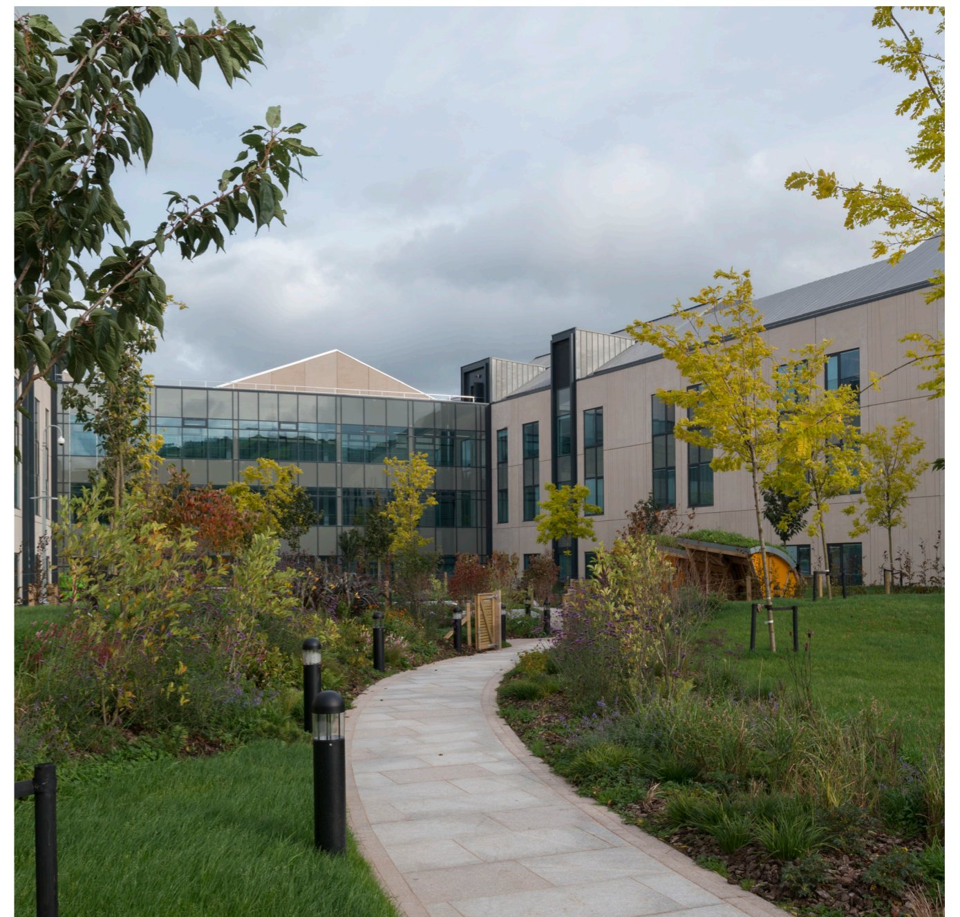
The use of native wildlife species in the green space contributed to the BREEAM very good standard achieved.