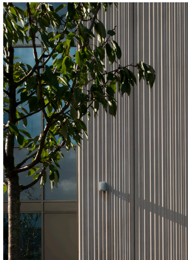
The Arts Strategy was integrated into the development rather than bolted on at the end.