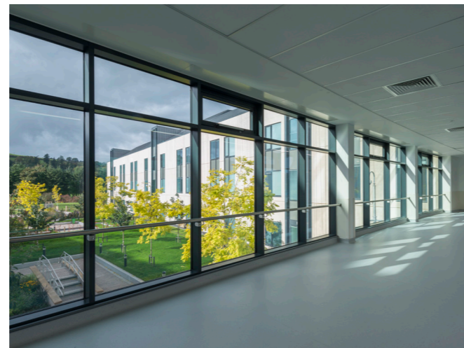
6 Top to bottom right: Main hospital atrium was designed as a welcoming civic space | Staff in wards underpinned by clear zoning strategy | Corridors are well lit and make good use of natural daylight.